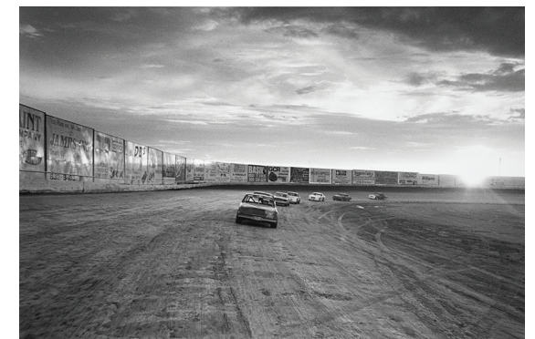
Short Track, Jake Mendel