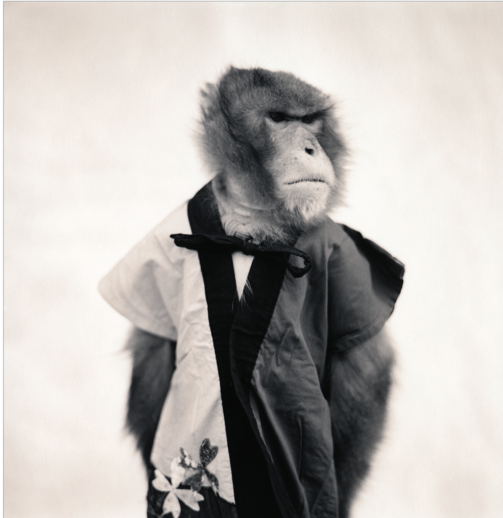
Choromatsu 2, 2008, Hiroshi Watanabe

THE SECOND PHOTO-EYE EDITIONS PUBLICATION SUO SARUMAWASHI LIMITED EDITION PORTFOLIO WILL BE UNVEILED AT THE OPENING, TWELVE 11X14 PIGMENT INK PRINTS FROM THE SUO SARUMAWASHI SERIES HOUSED IN AN ELEGANT BRUSHED ALUMINUM BOX. A DELUXE EDITION WITH A SIGNED SILVER PRINT IS ALSO AVAILABLE. ORDER ONLINE, FROM THE GALLERY OR CALL 505.988.5152 X121.